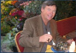
Hey, are those bluecheese mussels?